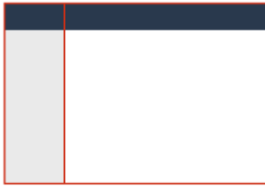
cPanel & WHM version 64